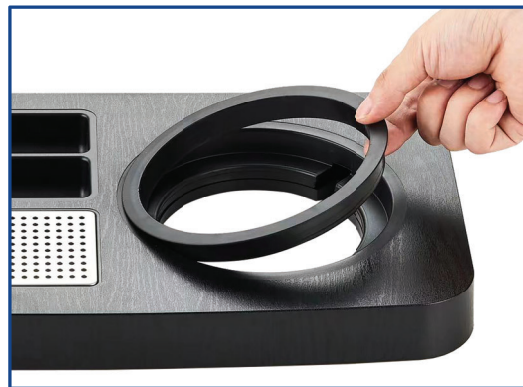
Removable Adaptor for Easy Cleaning