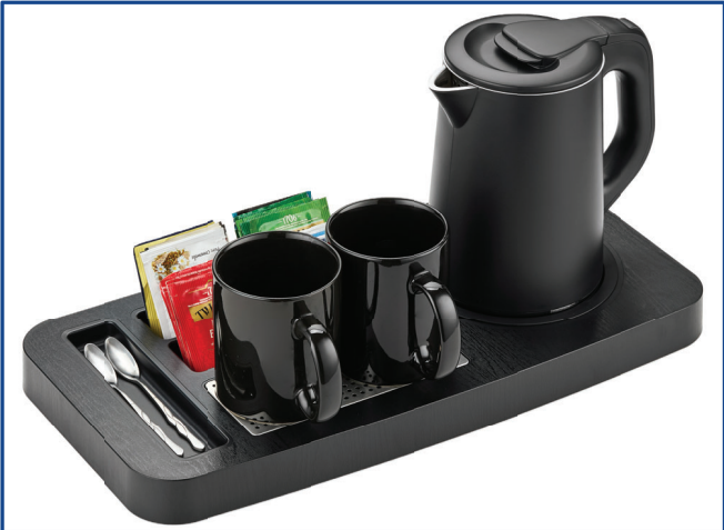
Exquisitely Crafted Adaptor for Hosting BANBURY Kettle