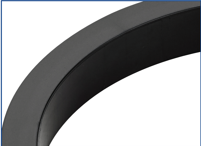
Widened Outer Edge