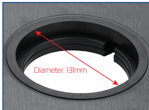
Inner Diameter 131mm